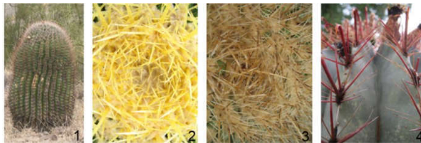
Figure 1: Saguaro cactus