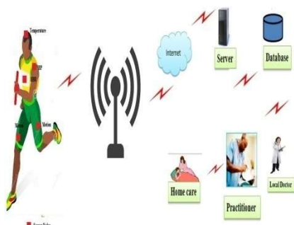
Example Scenario for Wireless Sensor Networks

embedded in the environment track the physical state of a person for continuous health diagnosis. So using this technology for monitoring the patients and get fitness of our body.